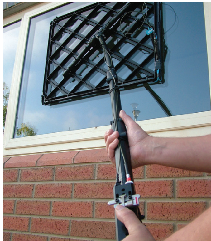
The DX10-U contains an integrated pole mounting feature